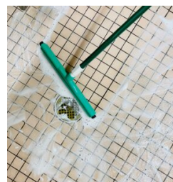
Floor Squeegee with Handle

Cleaning mirrors is a breeze with no bumping, thumping, or streaking