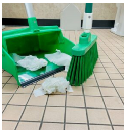
Dust Pan with Broom Handle

The Complete Kit for a Deep Clean You Can See