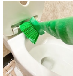
Long Handled Brush

Scrub sinks, countertops and easily reachable surfaces