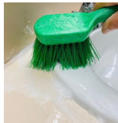
Short Handled Brush

Self opening and closing to sweep up dirt and debris